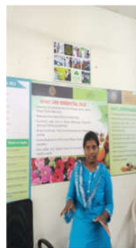
Fig 4. Ayurveda